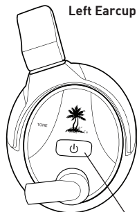
Power Button / Headset LED

In order to play audio, the PX4 headset must be "paired" (linked) to its transmitter. The headset and transmitter are paired out of the box. The instructions below are only necessary if pairing appears to have been lost.